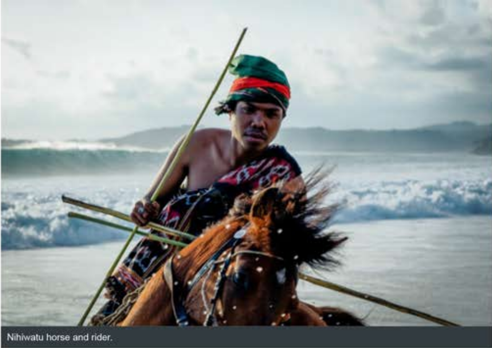
Nihiwatu horse and rider.