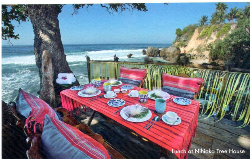
Lunch at Nihioka Tree House